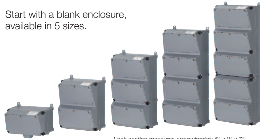
Each section measures approximately 5" x 9" x 7".

Start with a blank enclosure, available in 5 sizes.